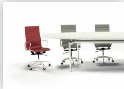
■ CEO Search and Consulting